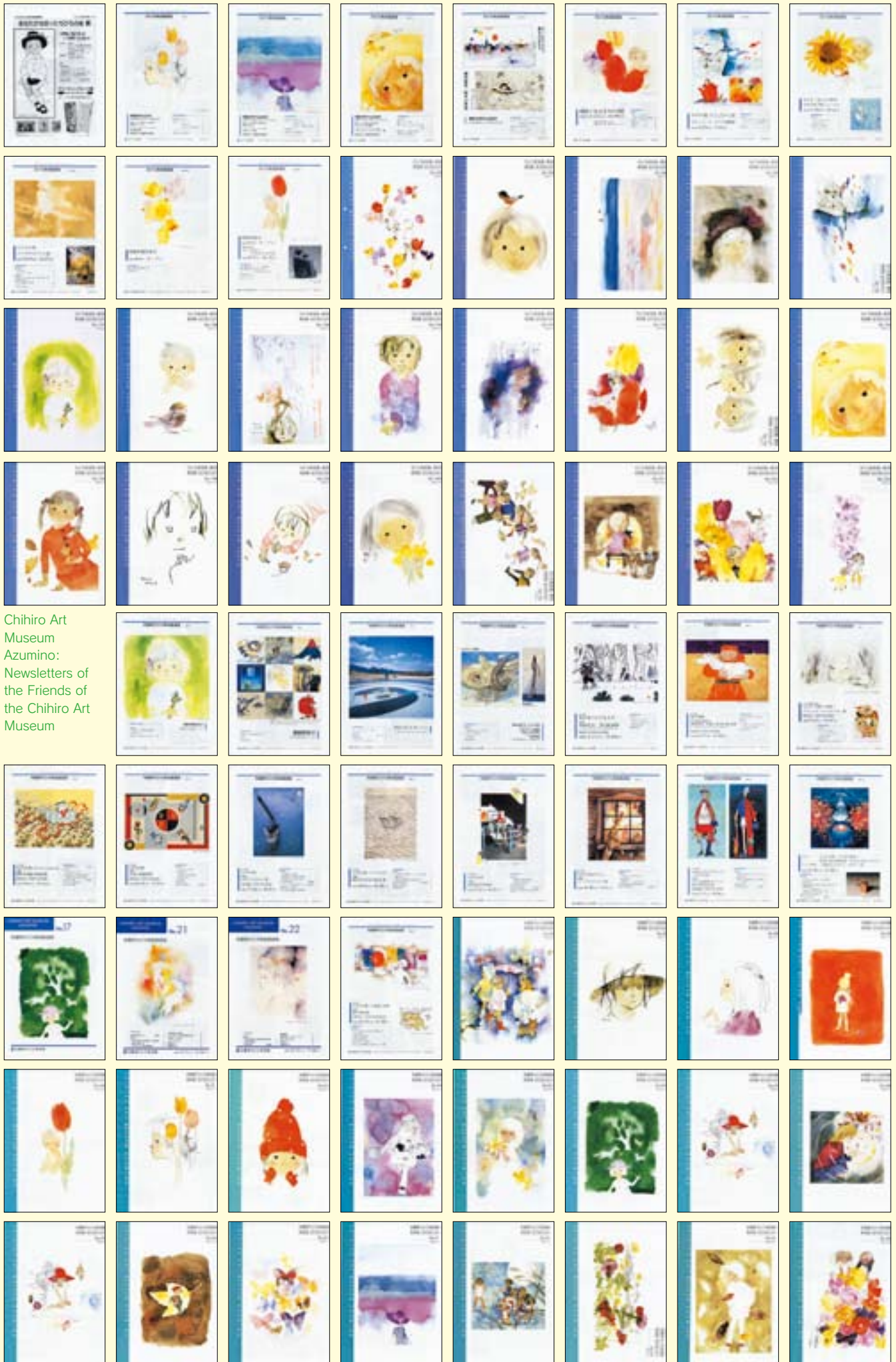
Chihiro Art Museum Azumino: Newsletters of the Friends of the Chihiro Art Museum