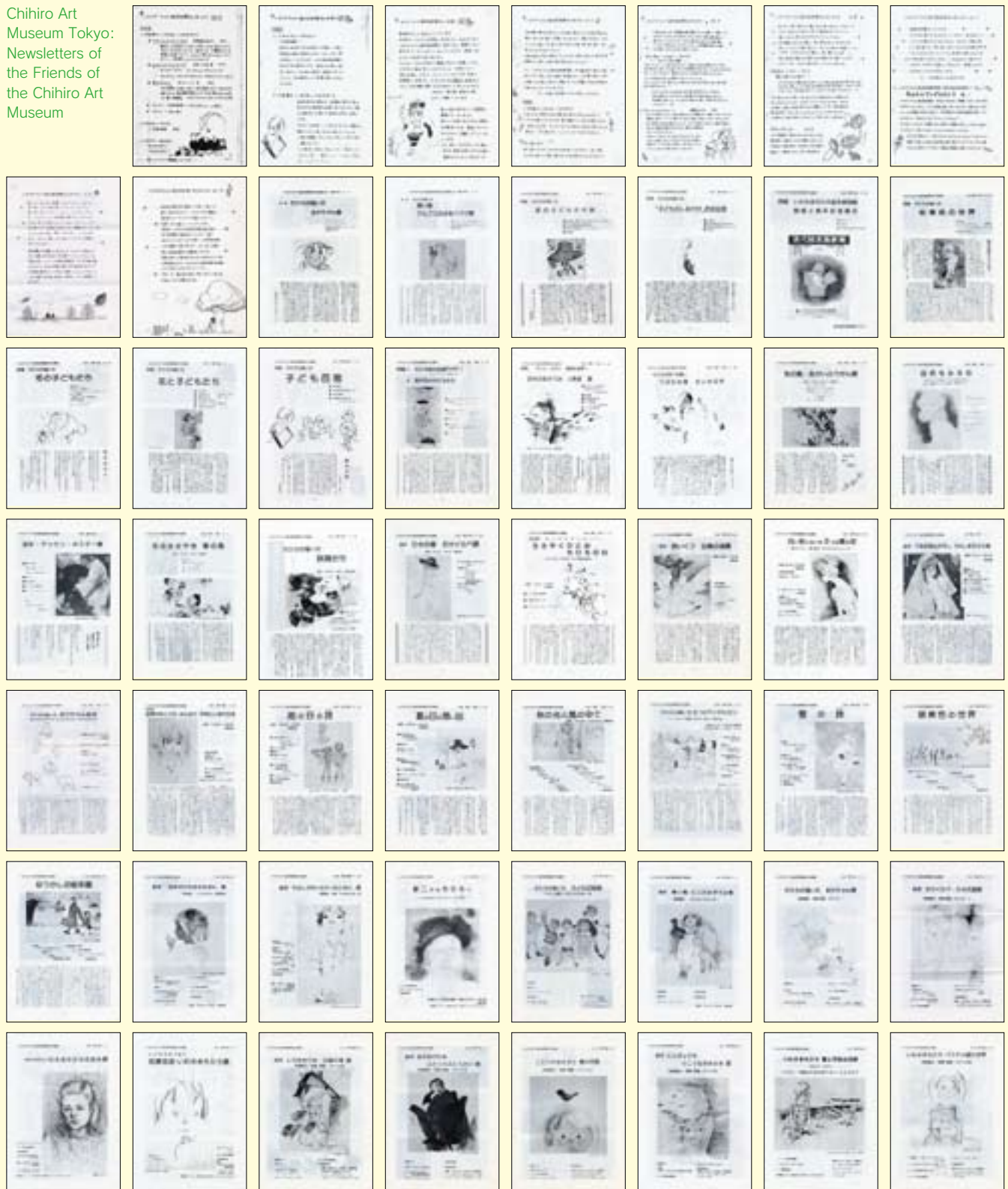
Chihiro Art Museum Tokyo: Newsletters of the Friends of the Chihiro Art Museum