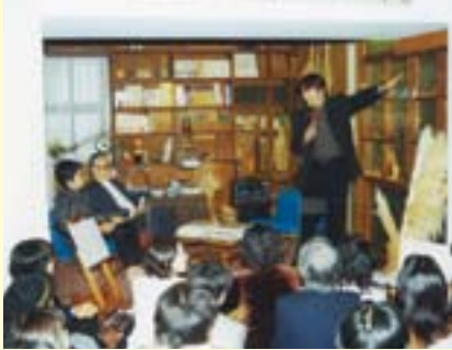
Meeting of the Friends of the Chihiro Art Museum, December 16, 2000