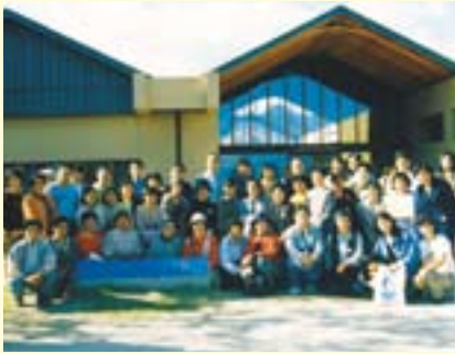
Azumino bus tour, September 28, 1997