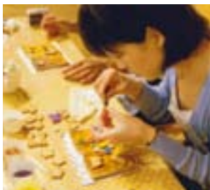
Goma's delicious and fun workshop Oct. 8, 2005