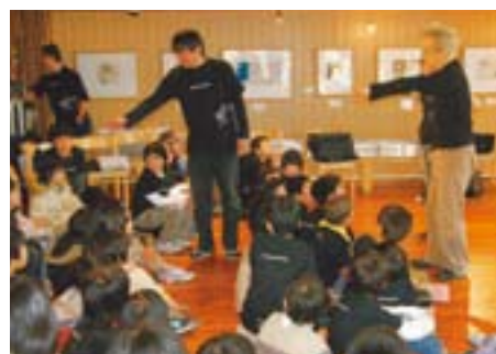
Outreach Theatrical Performance by the Matsumoto Performing Arts Centre: Grimm, Grimm, Grimm Mar. 24, 2007