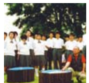
Open Class by Shigenobu Yoshida: Full of Rainbows July 9, 2005