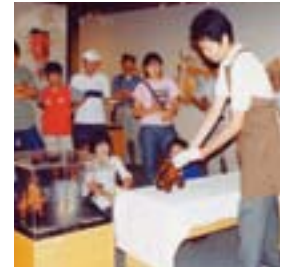
Middle-school student volunteers providing support at the Akiyoshi Shimazoe Exhibition July 27 to Aug. 19, 2002