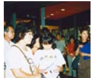
"Let's Enjoy the Chihiro Art Museum More" tour July 23, Aug. 13, 27, and Sept. 10, 2005