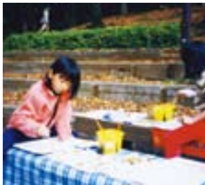
The workshop "Let's Play with Leaves" held in connection with "Chihiro's Autumn" exhibition (at Shakujii Park) Nov. 23, 2000