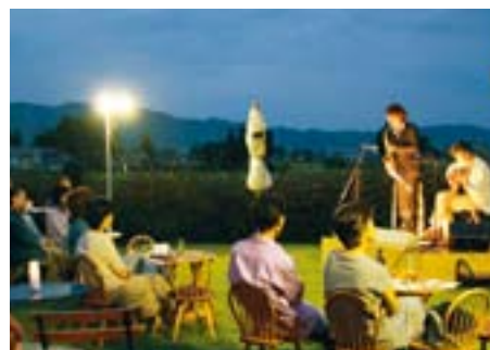
Museum Concert III Evening of Bossa Nova in Azumino: Sapatos Concert Sept. 1, 2006