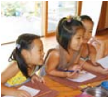
Visitors enjoy a hands-on summer-holiday workshop in the multipurpose gallery with middle school student volunteers. July 16 to Aug. 21, 2005