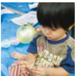
Azumino Art Line Summer School: Jump out into the Village! Full of Energy, We Are Craftsmen of Color July 29 and 30, 2006