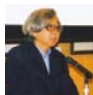
Oct. 4 to Nov. 15 Lecture: Yoji Yamada Selections/Cinema Club Nov. 1, 2003