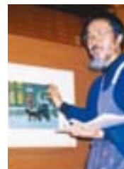
Gallery tour of the Takeshi Motai exhibition (commentary by Akira Ito) and Free Discussion Nov. 23, 1999