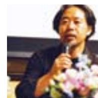
Special lecture by Hiroshi Naito to celebrate the first anniversary of the Chihiro Art Museum Tokyo "From Azumino to Tokyo" Oct. 11, 2003