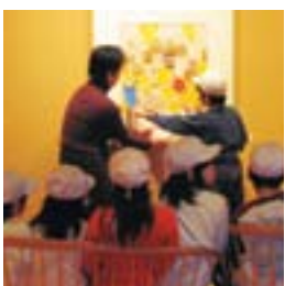
Integrated Study Period (third-graders in Class Ro at Matsukawa Elementary School) 2005