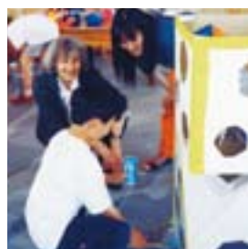
Workshop for Children by Květa Pacovská: Create, Depict, and Dance May 22, 1999