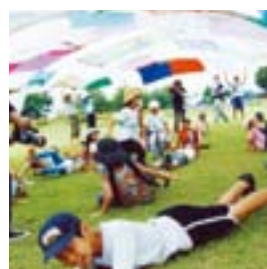
Azumino Art Line Summer School: Wind, Blue Sky, You, and Me, All Afloat in the Air July 30 and 31, 2005