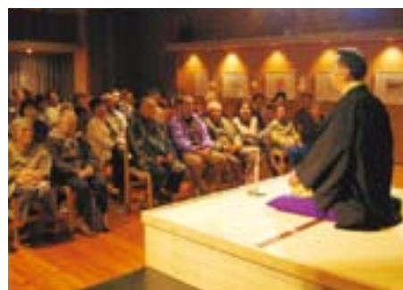
Azumino Autumn Evening of Yose Traditional Japanese Comic Storytelling Oct. 16, 2004