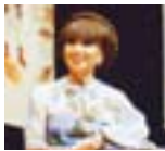
Commemorative event marking the 30th anniversary of Chihiro's death: Chihiro and Children throughout the World (lecturer: Tetsuko Kuroyanagi) Iino Hall Aug. 4, 2004