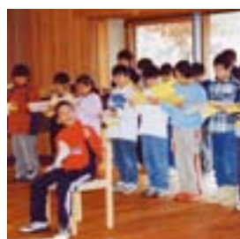
Field-trip class for fifth graders from Matsukawa Elementary School Nov. 30, 2001