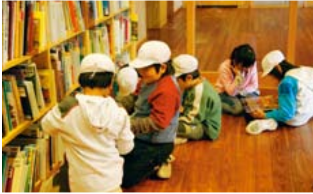
Students in the third-grade Class Ro at Matsukawa Elementary School work on an integrated study program focusing on the Chihiro Art Museum Azumino. For a one-year period starting in May, 2005