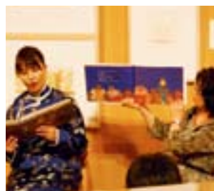
Let's Enjoy Stories in the Original Language: Asian Picture Books May 27, 2007