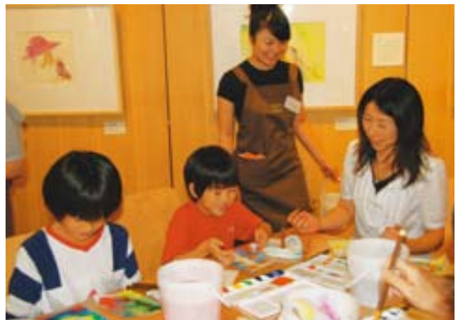
Workshop: You Too Can Be Chihiro! A Hands-on Workshop in Chihiro's Techniques The art club of Shakujii-minami Middle School, Nerima, Tokyo, takes part, offering volunteers to provide technical guidance. Aug. 6, 13, 20, 27, 2006