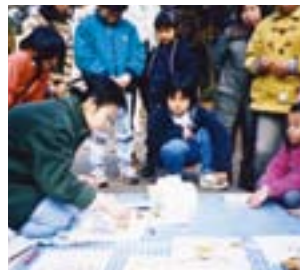
Hands-on workshop for parents and children using Chihiro's watercolor technique (at Shakujii Park) May 22 and 23, 1999