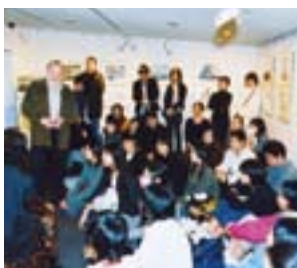
The workshop "Let's Talk with Yuri Norshteyn" Dec. 2, 2006