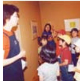
Workshop: Let's Play with Lines June 2, 2002