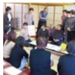
Traveling Workshop: Experimenting with Chihiro's Watercolor Techniques (at the Welfare Square in Azusagawa District, Matsumoto City) Jan. 23, 2007

2007 Sept. 23, Oct. 14, 28, Nov. 11, and 25 Slideshow and Talk: Chihiro and Käthe Kollwitz