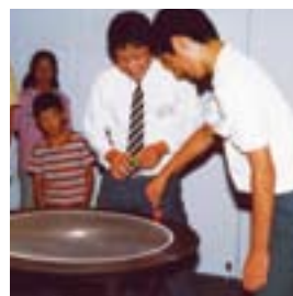
Middle-school student volunteers at the Kenich Kanazawa Exhibition July 26-Aug. 20, 2003