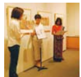
Let's Enjoy Stories in the Original Language: Sri Lankan Picture Books June 24 and July 7, 2007