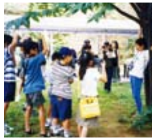
Workshop for Children: Ruiko Yoshida's Photography Class July 27 & Aug. 3, July 28 & Aug. 4, 1999