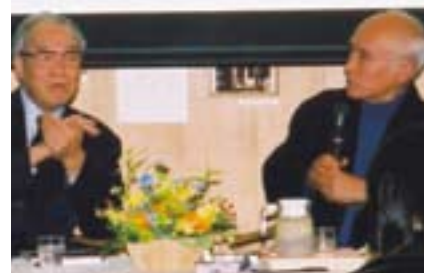
"Talking about Mr. Mado" Hayao Kawai (left) and Shuntaro Tanigawa Dec. 5, 2003