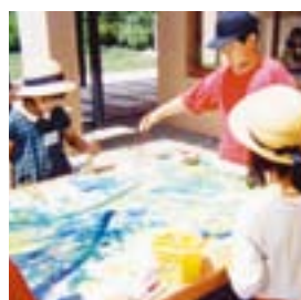
Workshop: Let's Find New Colors! Let's Play with Colors! July 1, 2001