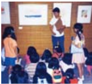
Art appreciation class July 28, 1997

Lectures and concerts are held based on the themes of exhibitions. At the multipurpose exhibition hall, activities based on the themes of “children,” “nature,” “peace,” and “life”—all themes Chihiro Iwasaki took a deep interest in—are held for both adults and children to enjoy and to broaden the scope of their art experience.