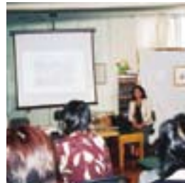
Traveling Class: Chihiro—the Desire for Peace (at Tatsuno High School, Tatsuno Town) July 17, 2005