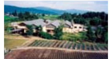
Aerial photo of Chihiro Art Museum Azumino upon opening (1997)