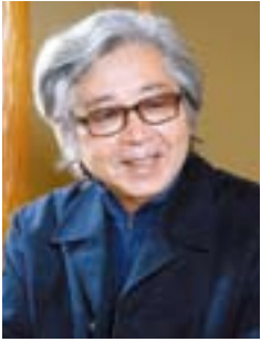
Chair, Chihiro Iwasaki Memorial Foundation