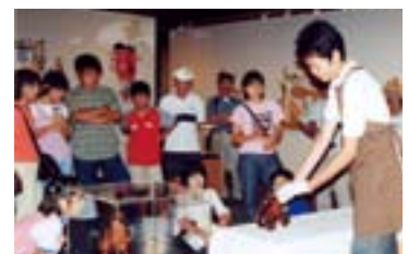
Junior-high-school student volunteers demonstrate how to create works of art and explain works on display in the exhibit “Playful Woodcraft of Akiyoshi Shimazoe” at Chihiro Art Museum Azumino (2002)