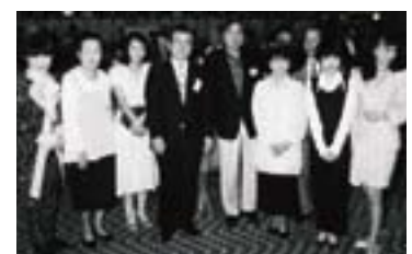
“Gathering to Rediscover Chihiro”, held at Tokyo Kaikan (1994)