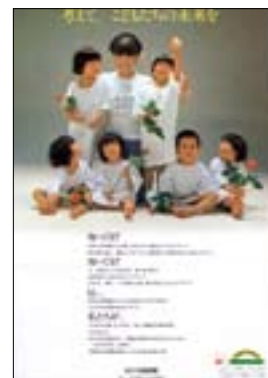
Chihiro Peace T-Shirts poster (1981)