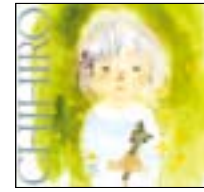
The catalogue of the Chihiro Iwasaki Exhibition II (1990)