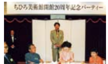
Party held to commemorate the 20th anniversary of Chihiro Art Museum Tokyo (1997)