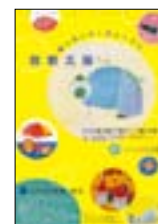
Pamphlet for the exhibition “Shinta Cho Exhibition” held at Chihiro Art Museum Tokyo (2006)