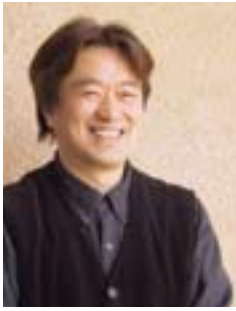
Director, Chihiro Art Museum Azumino