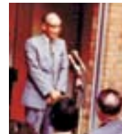
Tokyo Governor Ryo-kichi Minobe addresses the opening ceremony