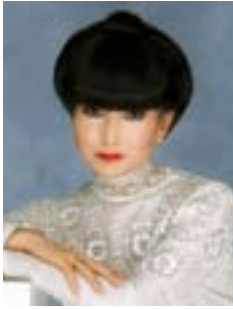
Director, Chihiro Art Museum Tokyo/ UNICEF Goodwill Ambassador