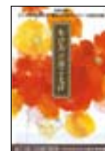
“The Language of Flowers in Chihiro’s Paintings” , published to commemorate the 100th exhibition of Chihiro Iwasaki’s works (1994)