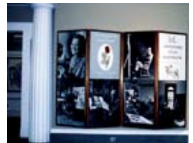
Introductory panel for exhibition of Chihiro Iwasaki’s works at the Norman Rockwell Museum in the United States (1996)