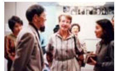
The director of the Musée Rodin (center), visiting the Churyo Sato/Chihiro Iwasaki Exhibition, and Churyo Sato (1984)