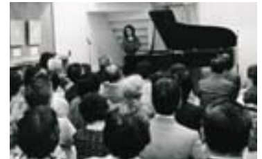
Piano recital held to mark the opening of the annex (1983)