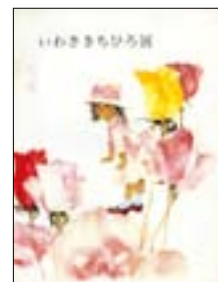
Pamphlet from 1979 exhibition of works by Chihiro Iwasaki (Fukui Fine Arts Museum)