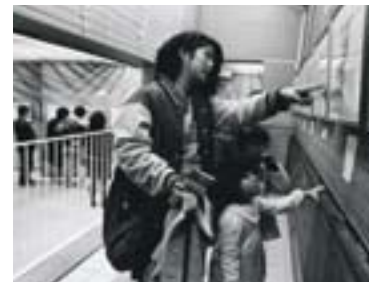
The exhibit room filled with museum visitors