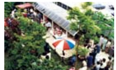
The reception held in the newly constructed garden to commemorate the museum’s tenth anniversary (1987)