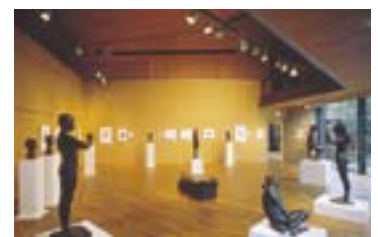
“Churyo Sato and Chihiro Iwasaki Exhibition” held at Chihiro Art Museum Tokyo (2005)