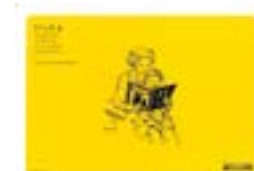
Japan Ad Council (AC) campaign to promote reading among children (2000)