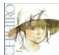
The catalog of the Chihiro Iwasaki Exhibition I (1987)