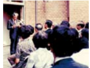
Chair Tai Nakatani addresses the opening ceremony of the Chihiro Iwasaki Art Museum of Picture Books (1977)