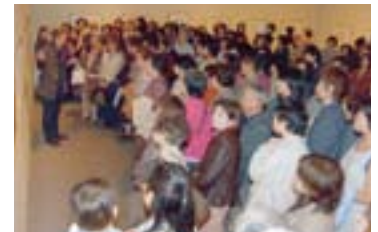
A gallery talk held in March 2004 at the Nagoya Matsuzakaya Museum