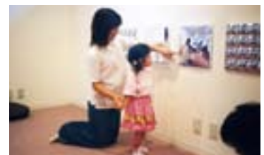
Chihiro Art Museum Tokyo opens after renovations (2002): The exterior (top) landscaped with keyaki trees; inside the barrier-free museum facilities (center), children can view distorting mirrors (bottom)